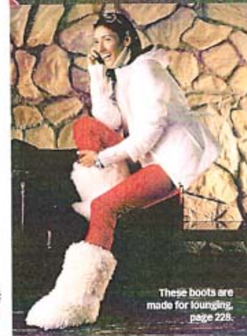
These boots are made for lounging, page 228.

By Heart ..... 173 How a few good poems see YONA ZELDIS McDONOUGH through every occasion.