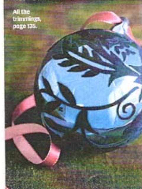
All the trimmings, page 135.